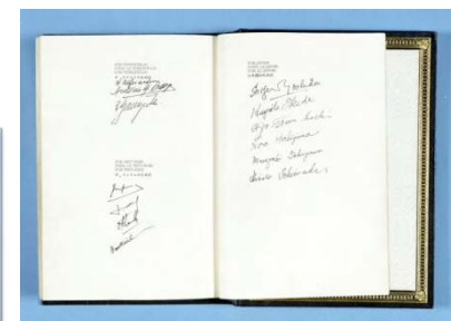
Treaty of Peace with Japan in 1951